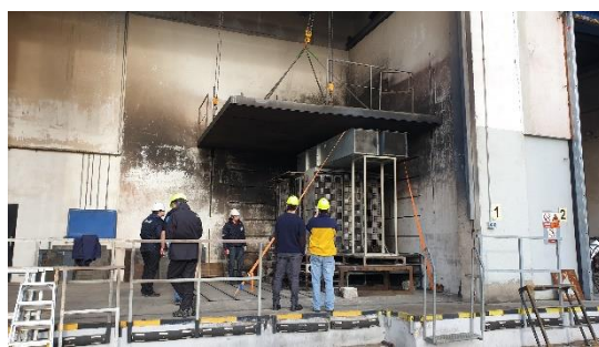
Figure 2-3 Dummy FCLi in the HV Test Bay