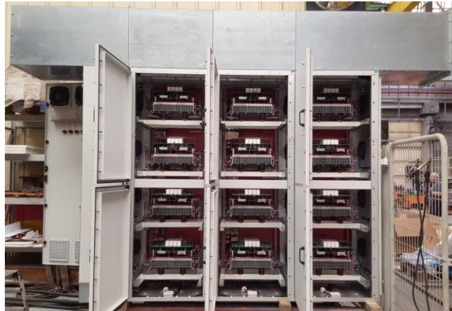
Figure 2-1 FCLi Build Complete

chosen solution. Section 2.2.5 describes the progress that has been made to review this updated design pack.