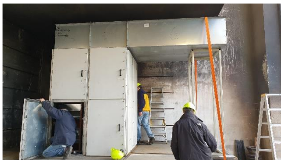
Figure 2-2 Dummy FCLi in the HV Test Bay

Figure 2-2 and Figure 2-3 show photographs of the dummy unit in the HV test bay prior to application of the short circuit current.